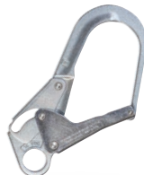
Steel Rebar Hook 2-1/2" (63.5 mm) Gate Opening