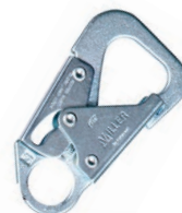
Miller 5K® Steel Snap Hook 0.87" (22 mm) Gate Opening