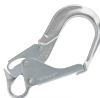
Aluminum Rebar Hook 2-1/2" (63.5 mm) Gate Opening