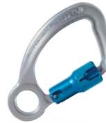
Aluminum Captive Eye Carabiner 0.86" (22 mm) Gate Opening