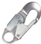
Aluminum Snap Hook 3/4" (19.1 mm) Gate Opening