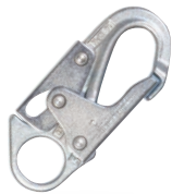
Steel Snap Hook 3/4" (19.1 mm) Gate Opening