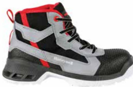
JUMP MID S3 HI CI SRC Ref: 62 461 66