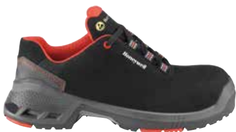
PRIME S3 HI CI SRC Ref: 62 461 72