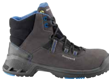
MOVE MID S3 HI CI SRC Ref: 62 461 77