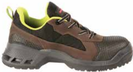
SPRINT S3 HI CI SRC Ref: 62 461 63