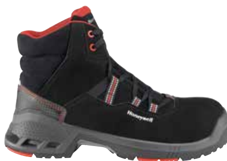
PRIME MID S3 HI CI SRC Ref: 62 461 73