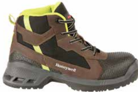
SPRINT MID S3 HI CI SRC Ref: 62 461 64