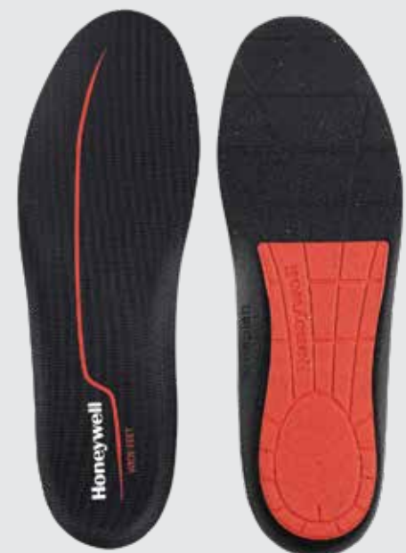
ULTIMATE WIDE INSOLE Ref: 62 462 00