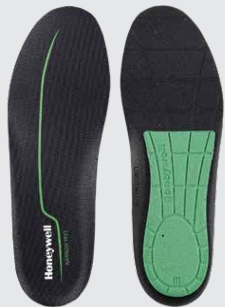
ULTIMATE NARROW INSOLE Ref: 62 461 99

The fitting can be adapted by use of a choice of two specially-made insoles for “wide feet” or “narrow feet”. The Adjustable fitting system, featuring specialist insoles, allows users to adjust the space inside the shoe to achieve a tighter fit to suit narrow feet or to create more room for the comfort of users with wider feet.