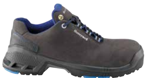
MOVE S3 HI CI SRC Ref: 62 461 76