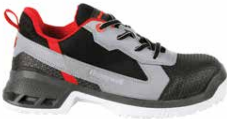
JUMP S3 HI CI SRC Ref: 62 461 65