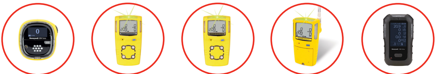
Honeywell BW™ Solo

Remote monitoring through Safety Communicator is available for the following Honeywell BW™ portable gas detectors: